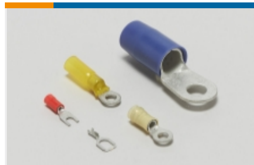
Ring Terminals &amp; Spade Terminals(28)